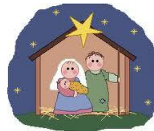
THE NATIVITY PLAY