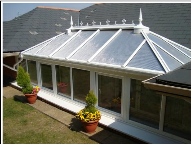
Just the finishing touches needed now!

Progress on the new conservatory to date -